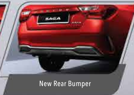
New Rear Bumper