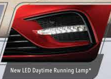
New LED Daytime Running Lamp*