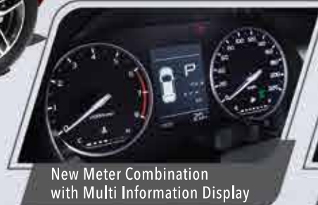
New Meter Combination with Multi Information Display