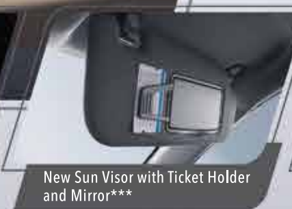
New Sun Visor with Ticket Holder and Mirror***