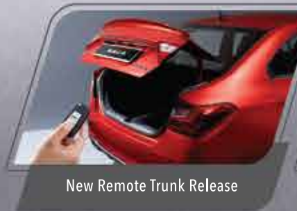
New Remote Trunk Release