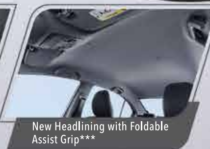
New Headlining with Foldable Assist Grip***