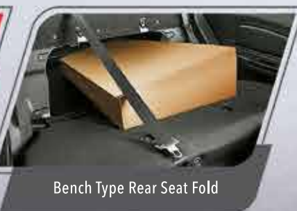
Bench Type Rear Seat Fold