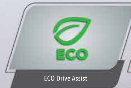
ECO Drive Assist