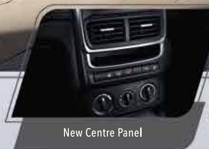
New Centre Panel