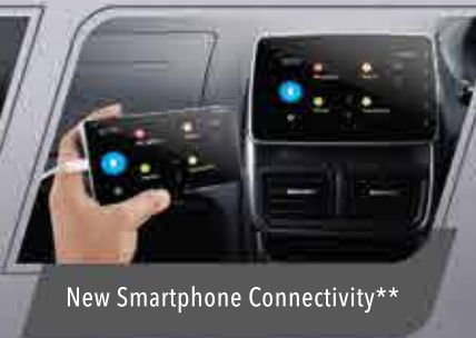
New Smartphone Connectivity**