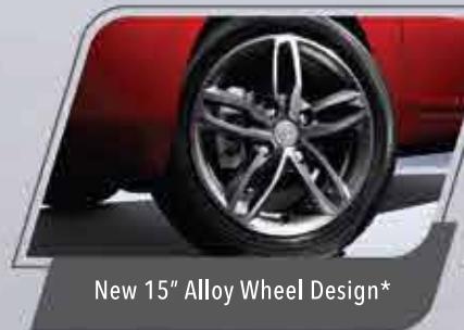
New 15" Alloy Wheel Design*