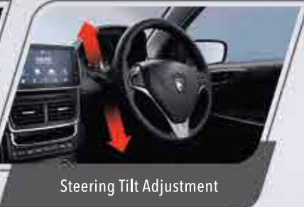
Steering Tilt Adjustment