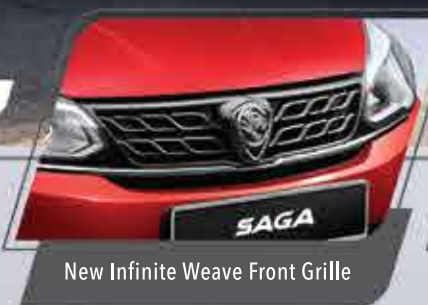
New Infinite Weave Front Grille