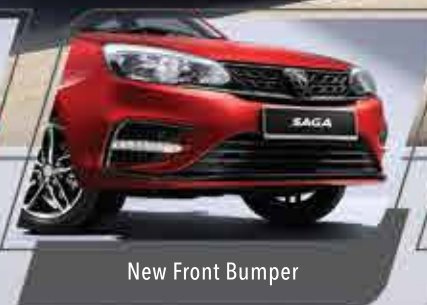
New Front Bumper