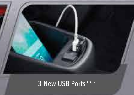
3 New USB Ports***