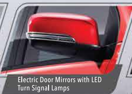
Electric Door Mirrors with LED Turn Signal Lamps