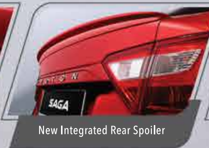
New Integrated Rear Spoiler