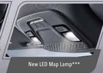
New LED Map Lamp***